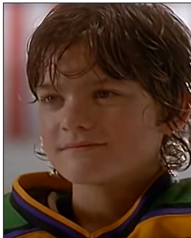
Available on Hulu & HBO