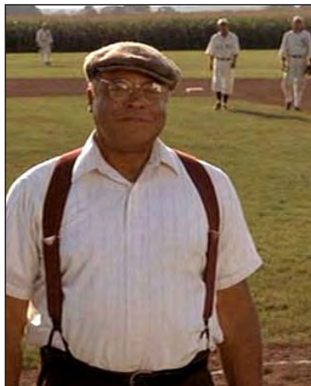
Available on Hulu