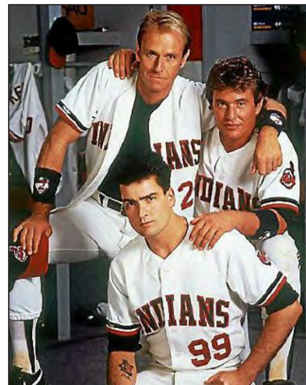
Available on Amazon Prime