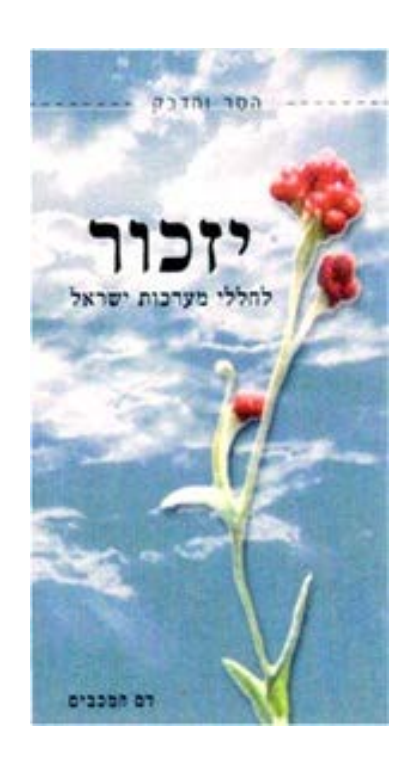
Yom Hazikaron sticker