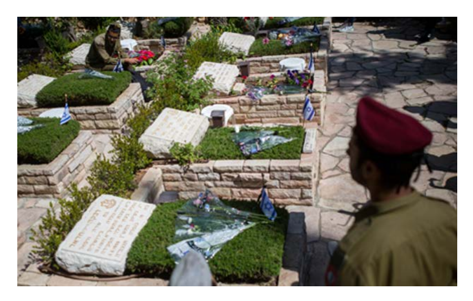
Graves in Mount Herzel in Yom Hazkaron day

In general, flowers became a symbol of the gentle and delicate soldiers who have been picked from life before their time. It is common to see a lone flower on a grave, and every year soldiers volunteer to visit graves not surrounded by family members and put a flower and an Israeli flag on them, so they won't be empty.