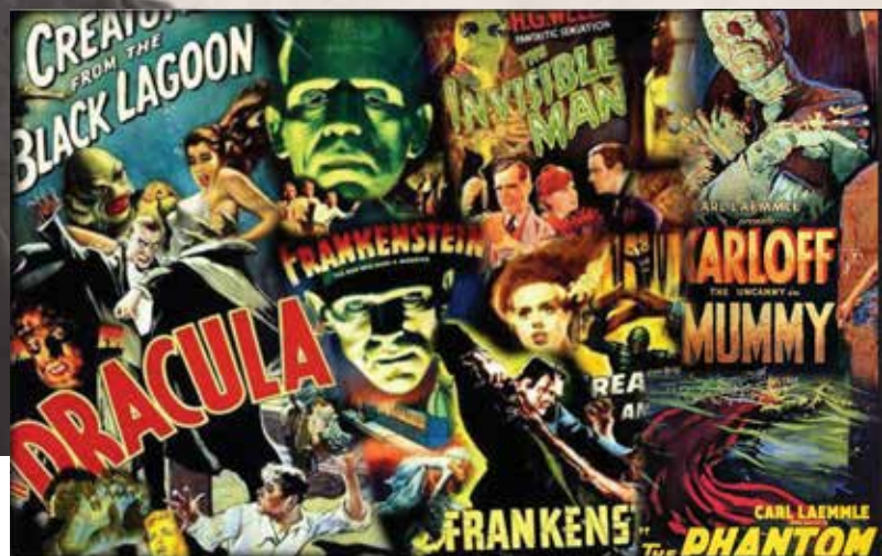
Classic Universal Studios monster films, most of which were produced by Carl Laemmle