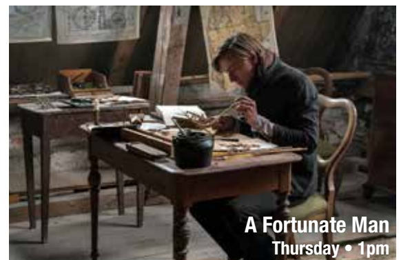
A Fortunate Man Thursday • 1pm