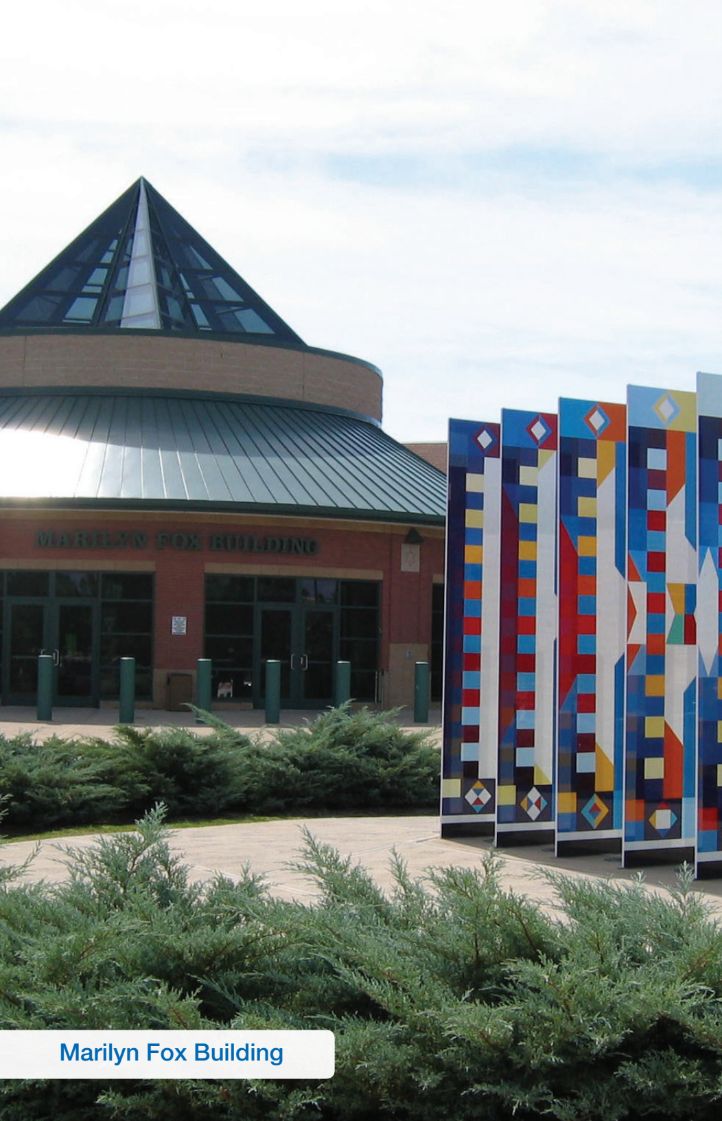
Marilyn Fox Building