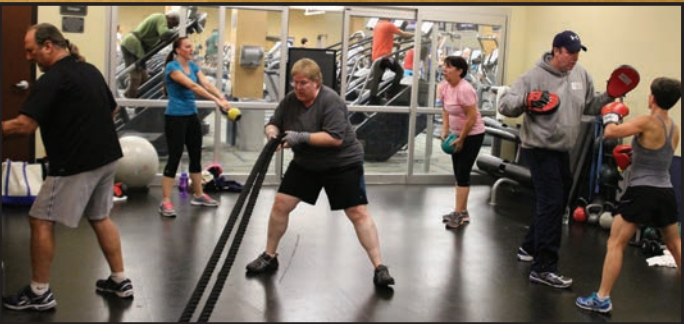
Box Your Best