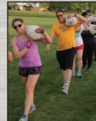
Outdoor Boot Camp